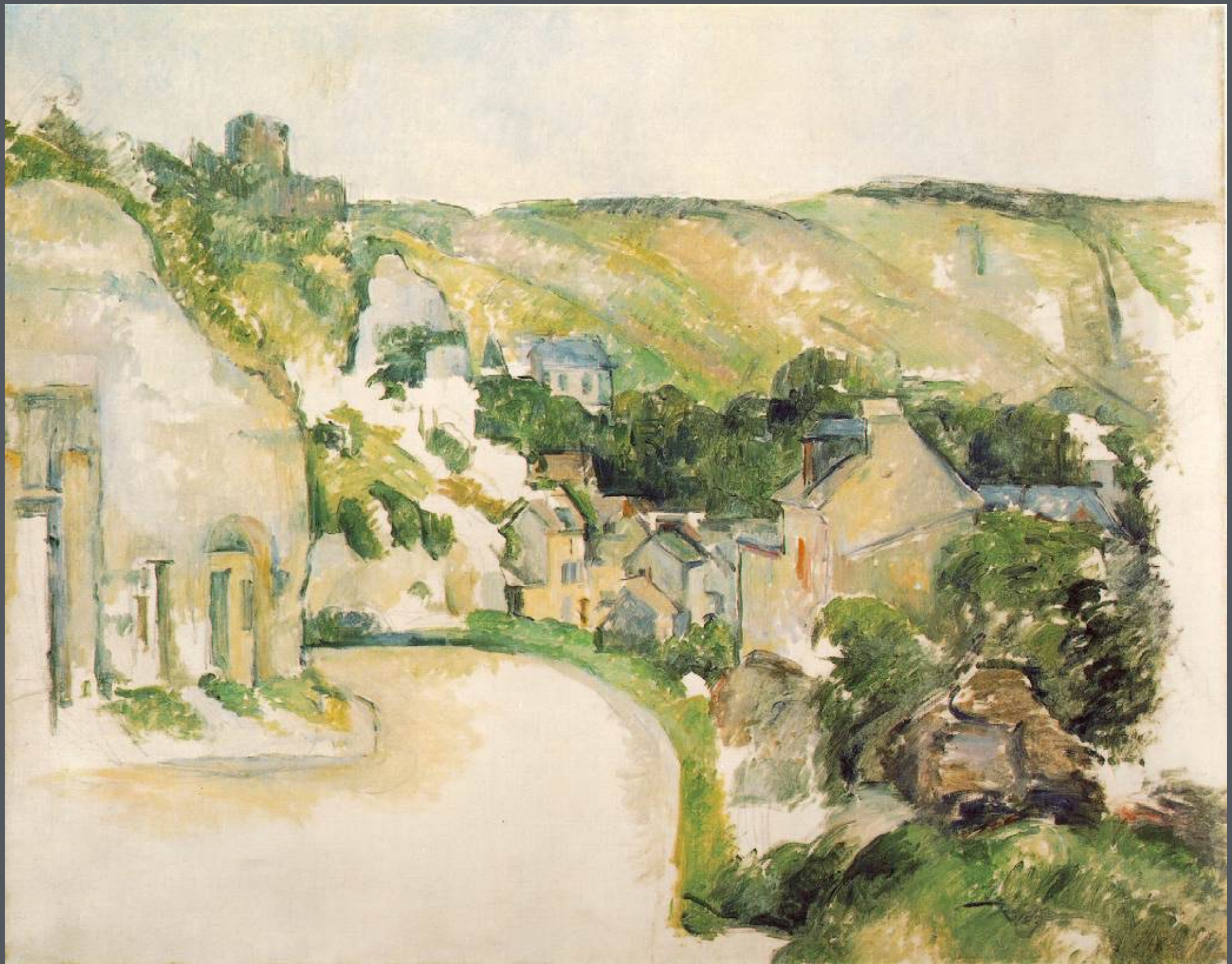
Cézanne, A turn in the road at la Roche-Guyon, 1885