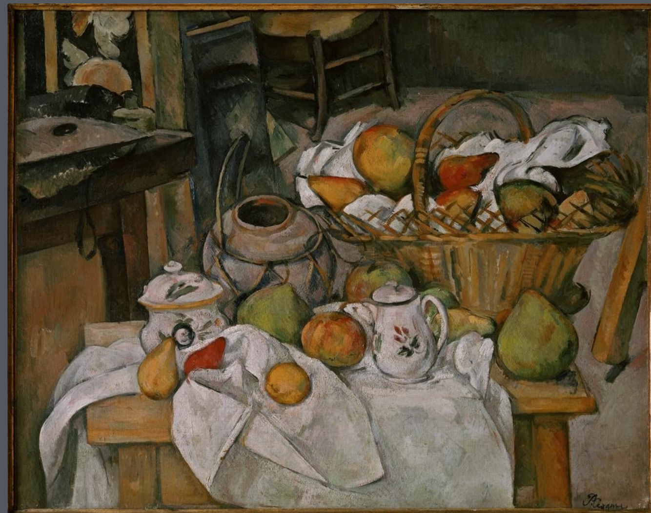
L: Monet, Haystacks (Effects of Snow and Sun), 1891 R: Cézanne, Still Life with Vessels, Basket, and Fruit, 1888-90