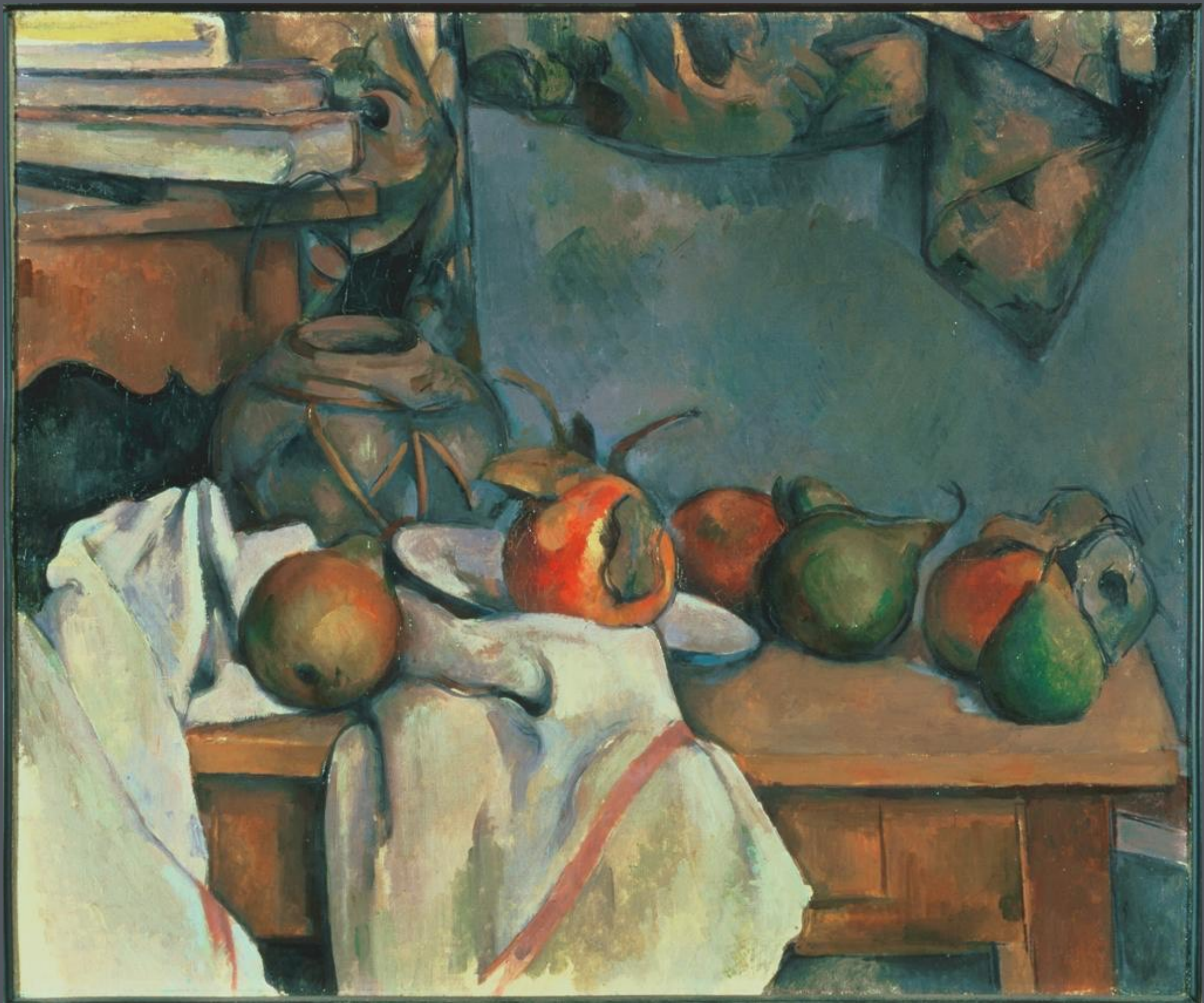
Cézanne, Ginger Pot with Pomegranate and Pears, 1893