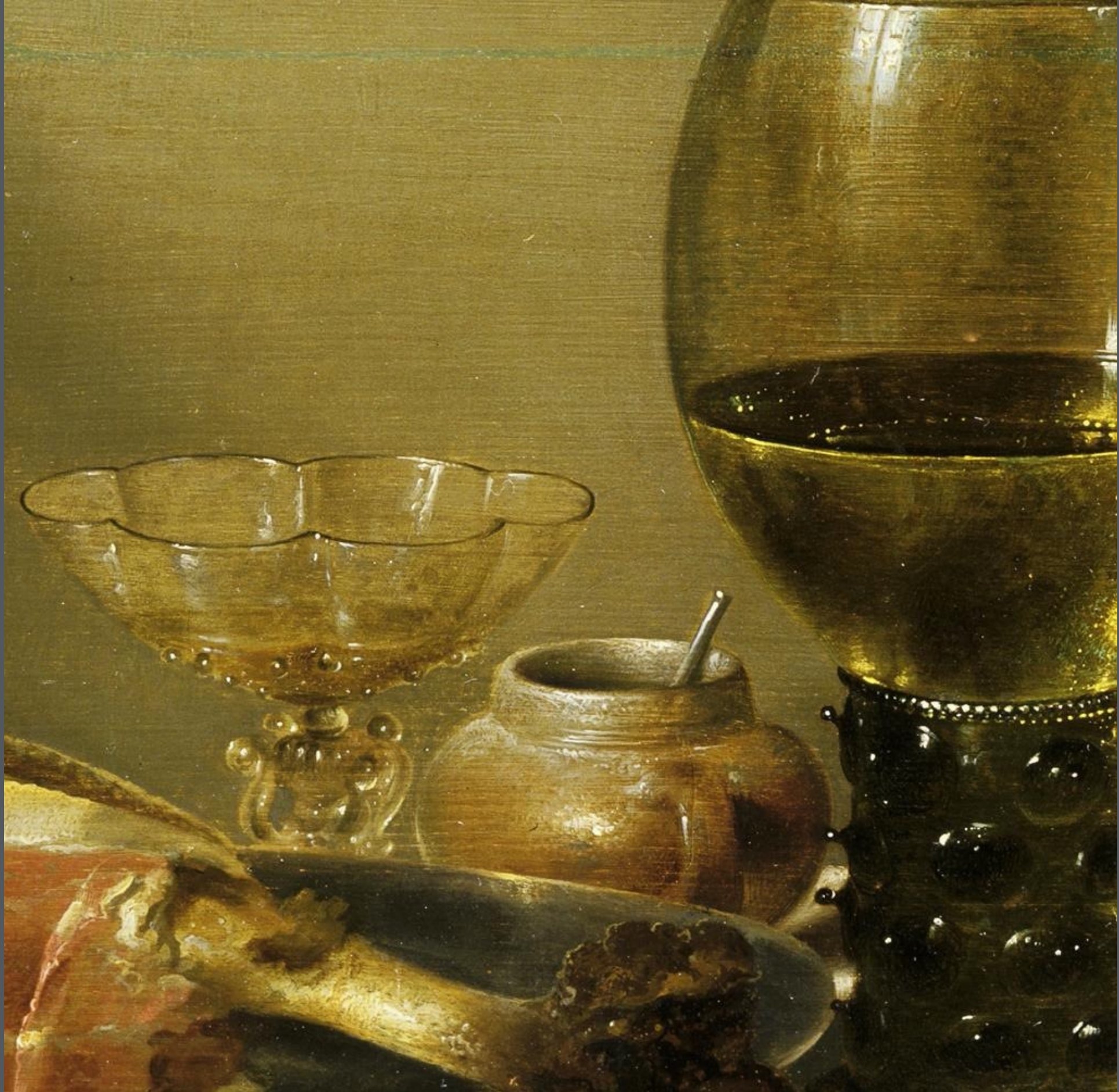
Detail: William Claesz Heda,, Still Life with Ham, 1631-34