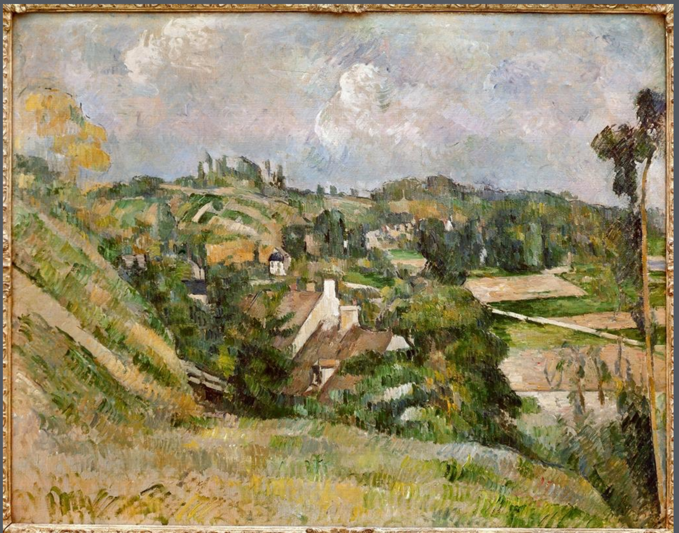
Cézanne, Auvers from Val Harmé (Auvers-sur-Oise), 1879-82