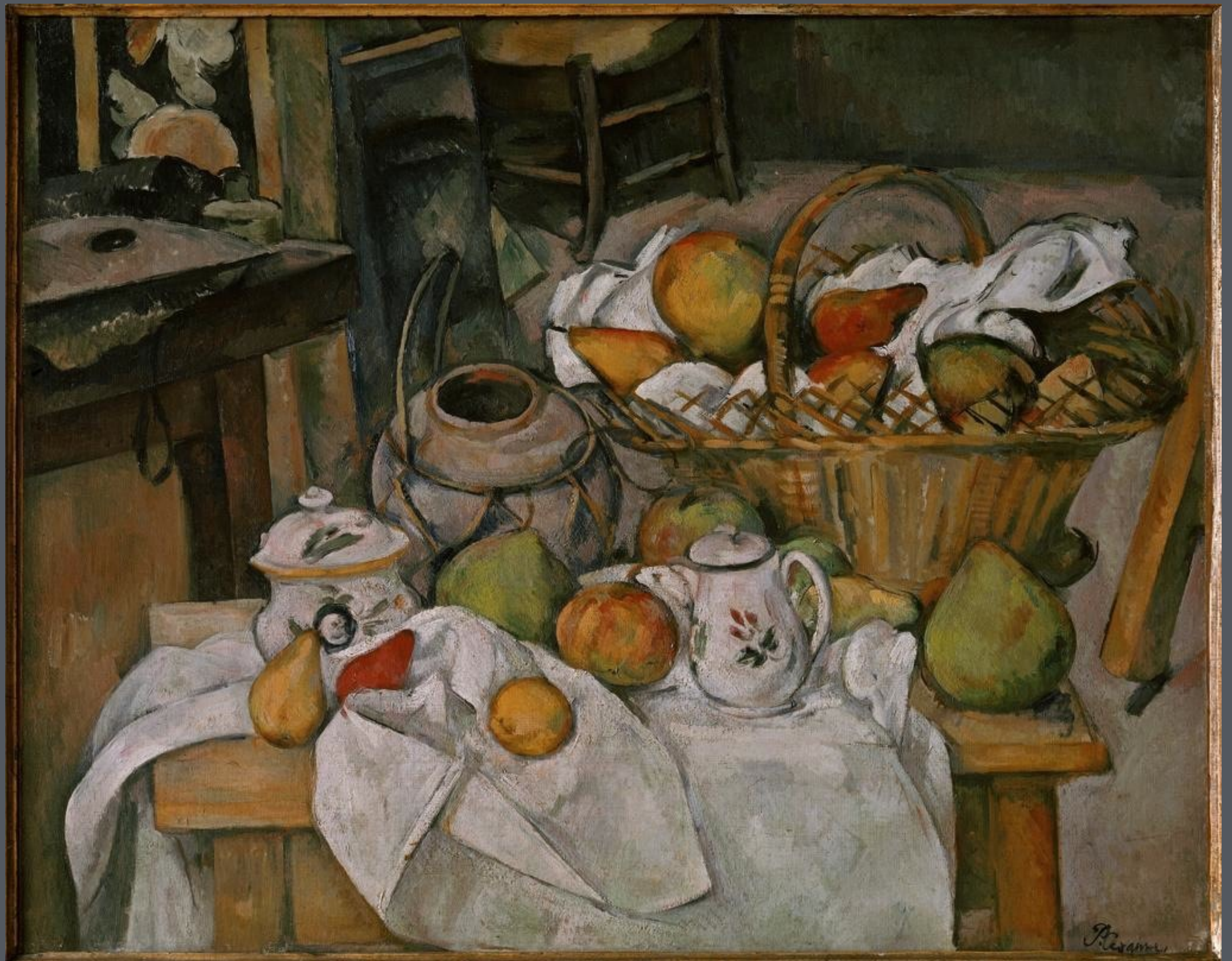
Cézanne, Still Life with Vessels, Basket, and Fruit, 1888-90 What seems “off?” As if the artist did not know what he was doing?