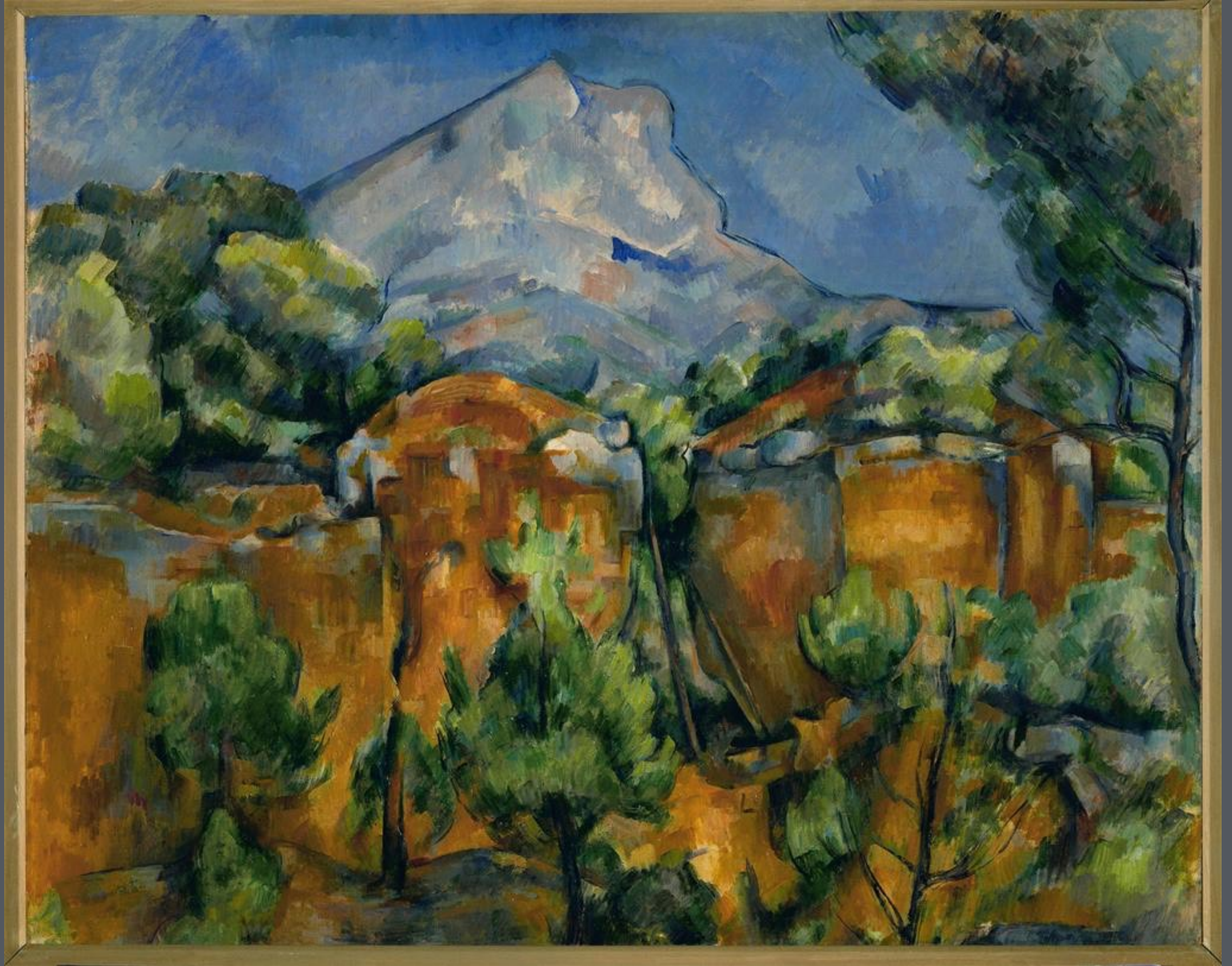
Cézanne, Mont Sainte-Victoire, 1897