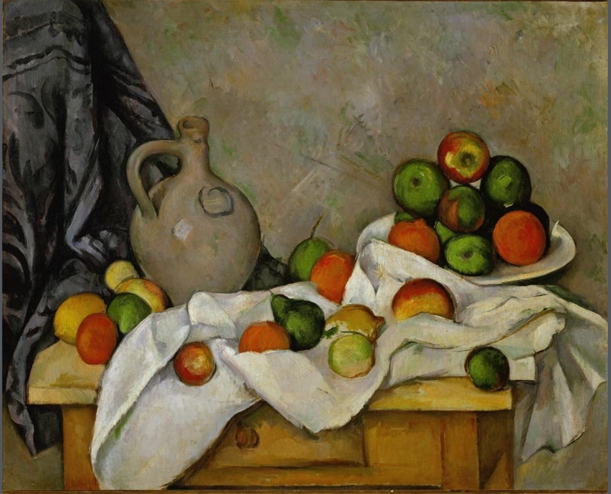
Cézanne, Curtain Jug and Bowl, 1893-94