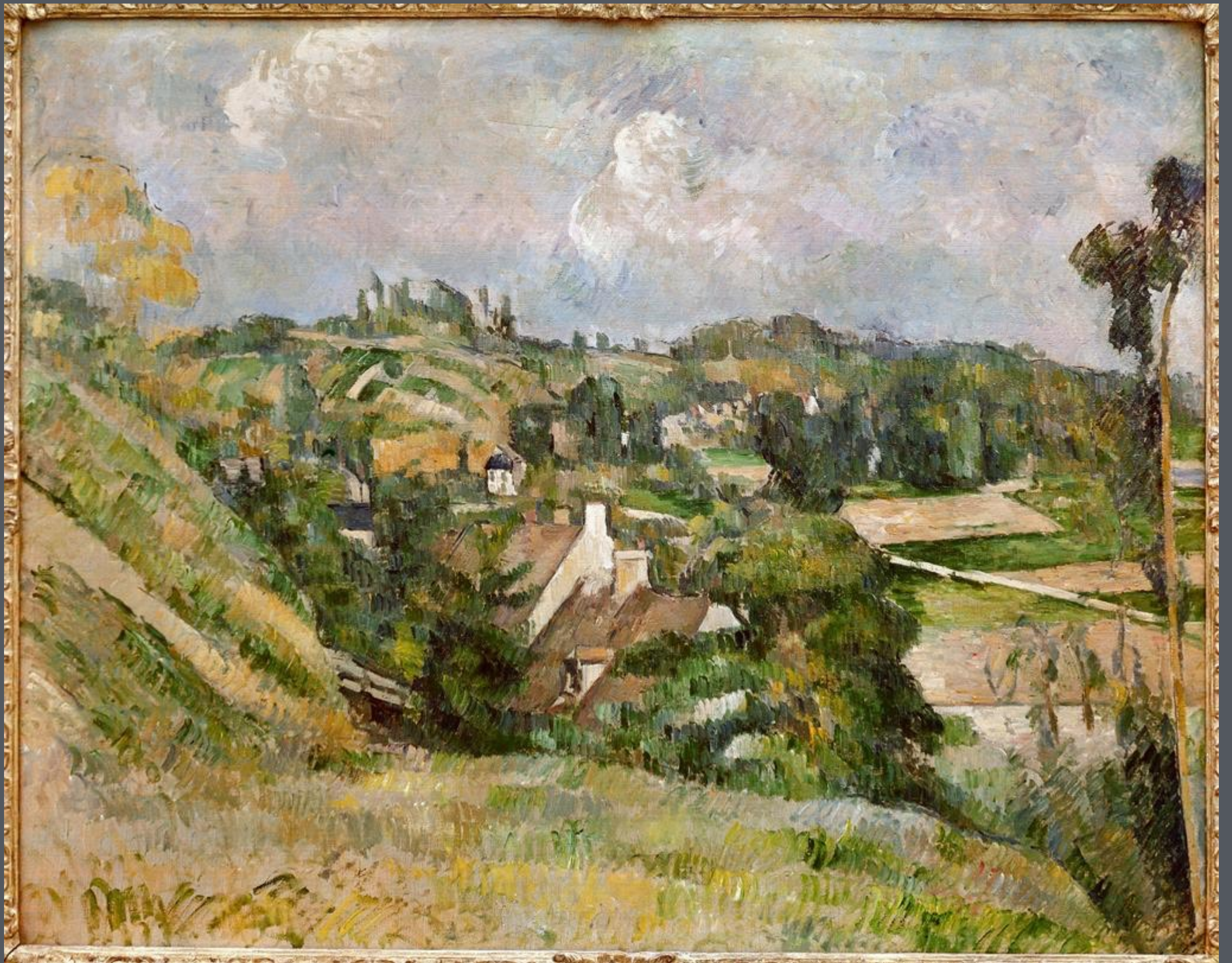
Cézanne, Auvers from Val Harmé (Auvers-sur-Oise), 1879-82