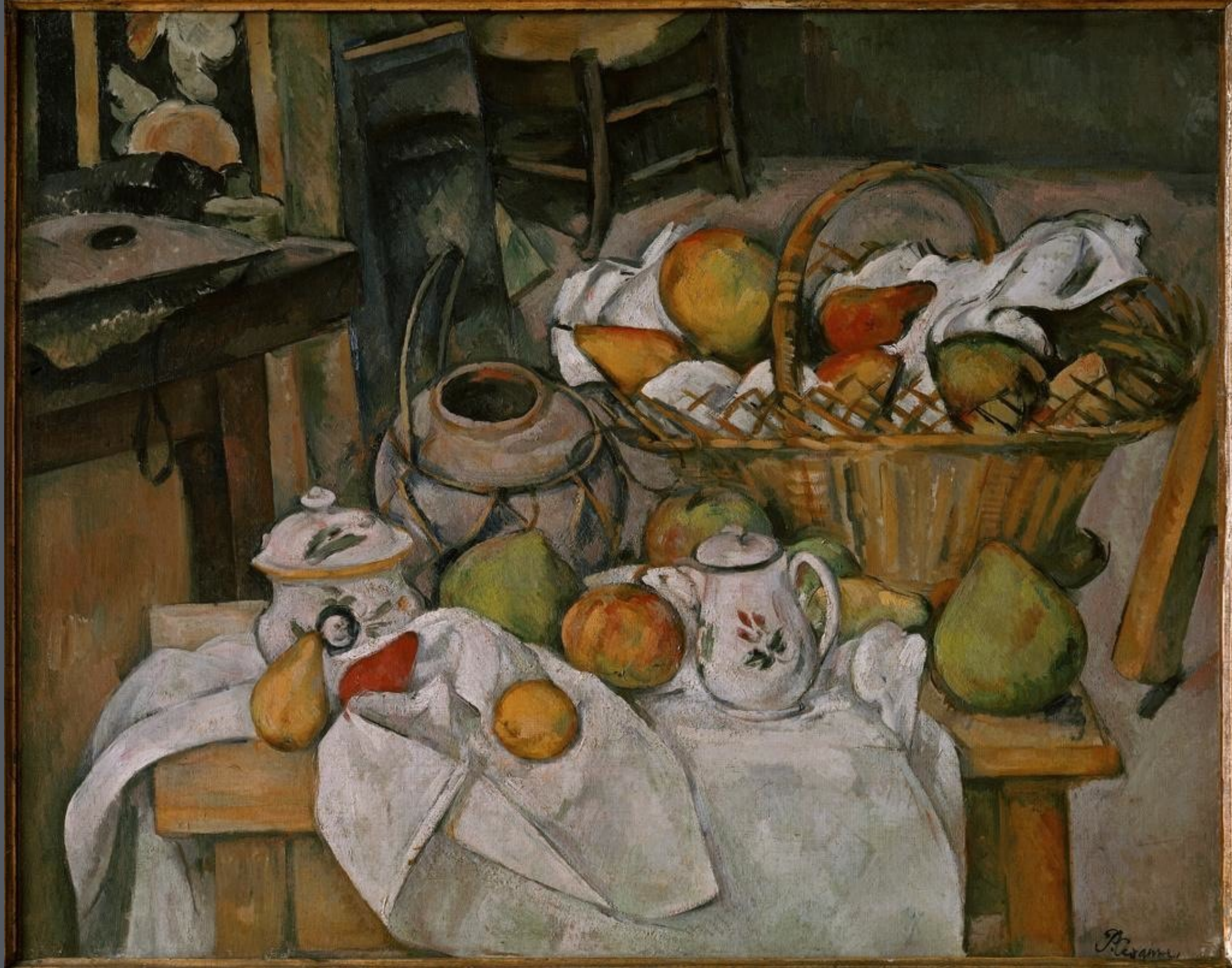
Cézanne, Still Life with Vessels, Basket, and Fruit, 1888-90

"I want to make of Impressionism an art as solid as that of the museums." -