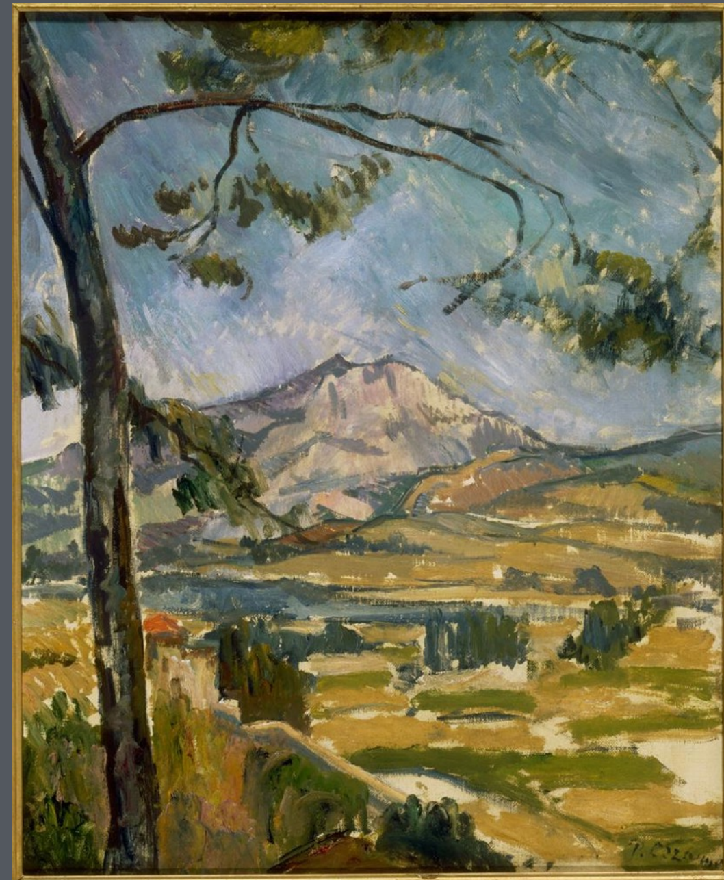
Cézanne, Mont Sainte-Victoire with Large Pine, 1887 Imitator of Cézanne, late 19th early 20th