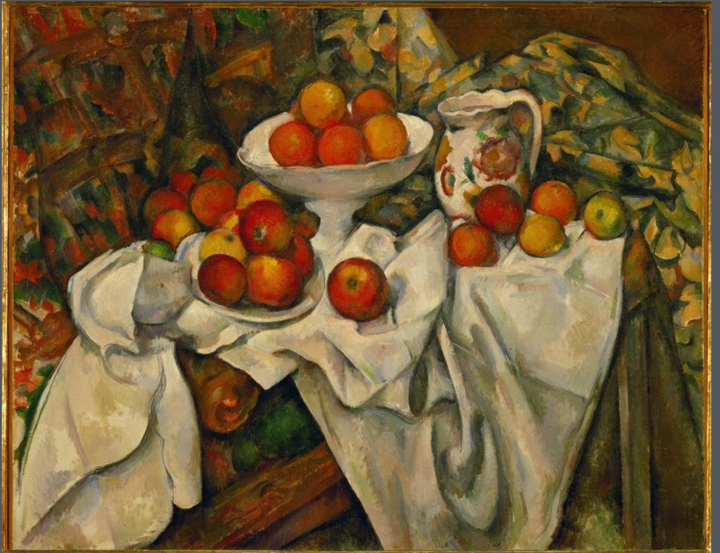
Cézanne, Apples and Oranges, 1899