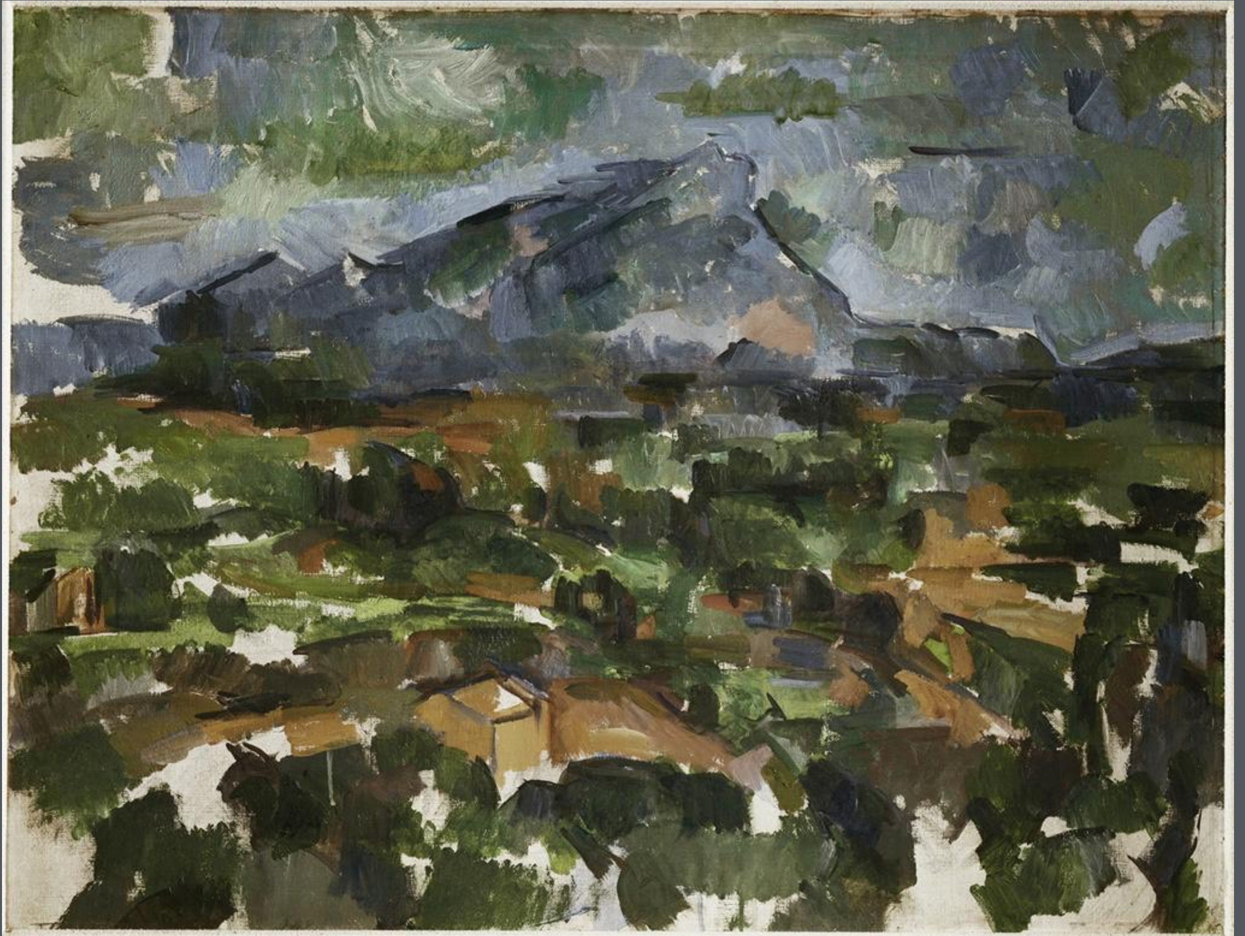
Cézanne, Mt St Victoire, 1902-06