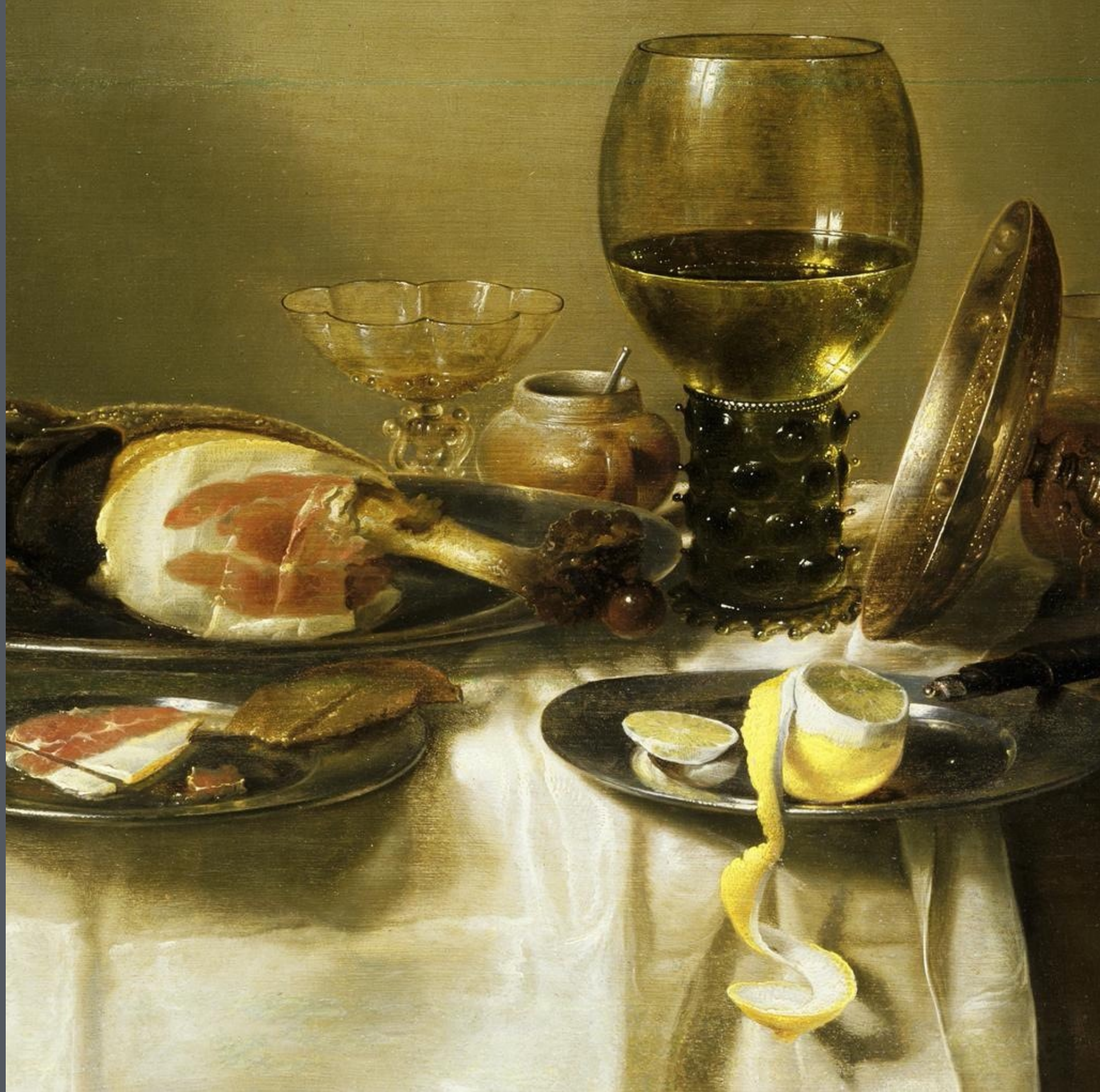
Detail: William Claesz Heda, Still Life with Ham, 1631-34