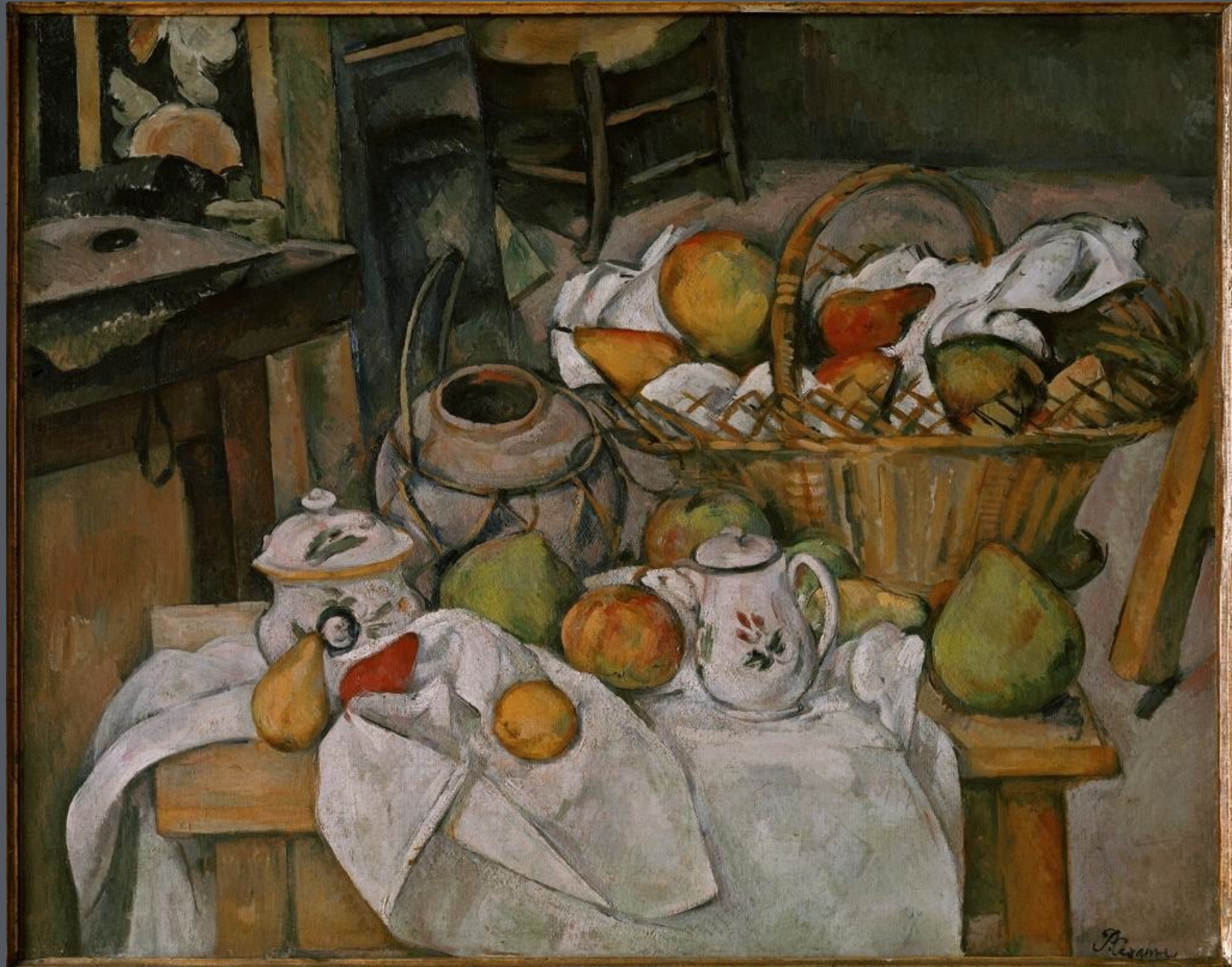
L: Van Gogh Vase with Twelve Sunflowers 188-89 R: Cézanne, Still Life with Vessels, Basket, and Fruit, 1888-90