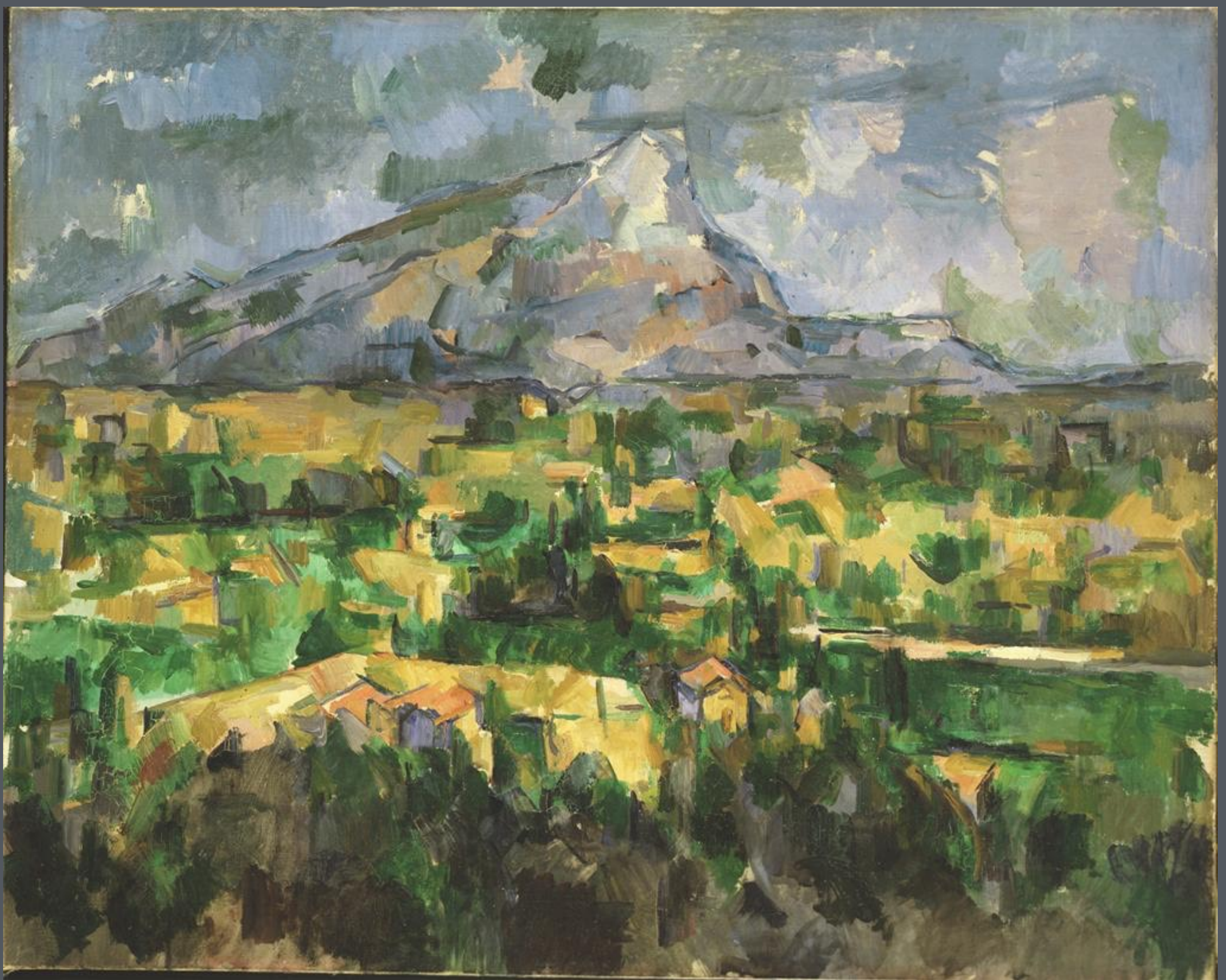
Cézanne, Mont Sainte-Victoire, 1902-04